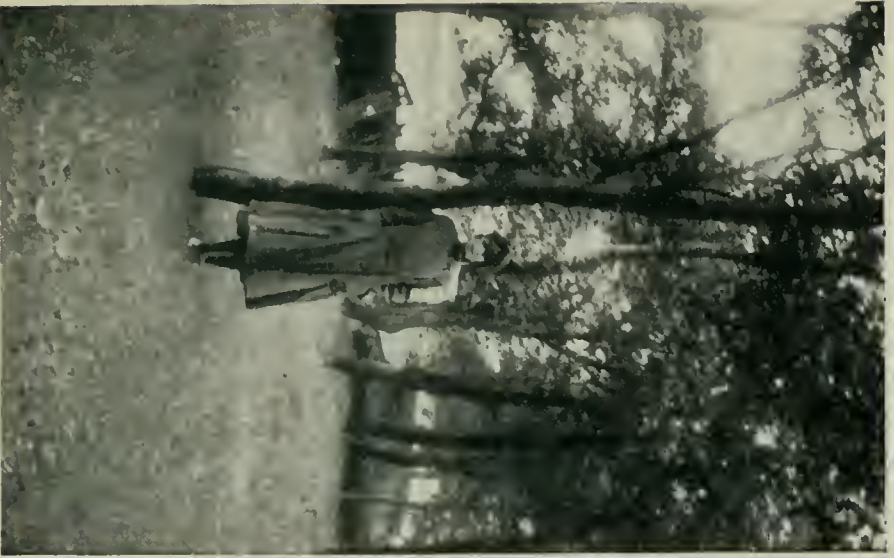
ELsie IN 1920, STANDING NEAR WHERE THE GNOME WAS TAKEN IN 1917