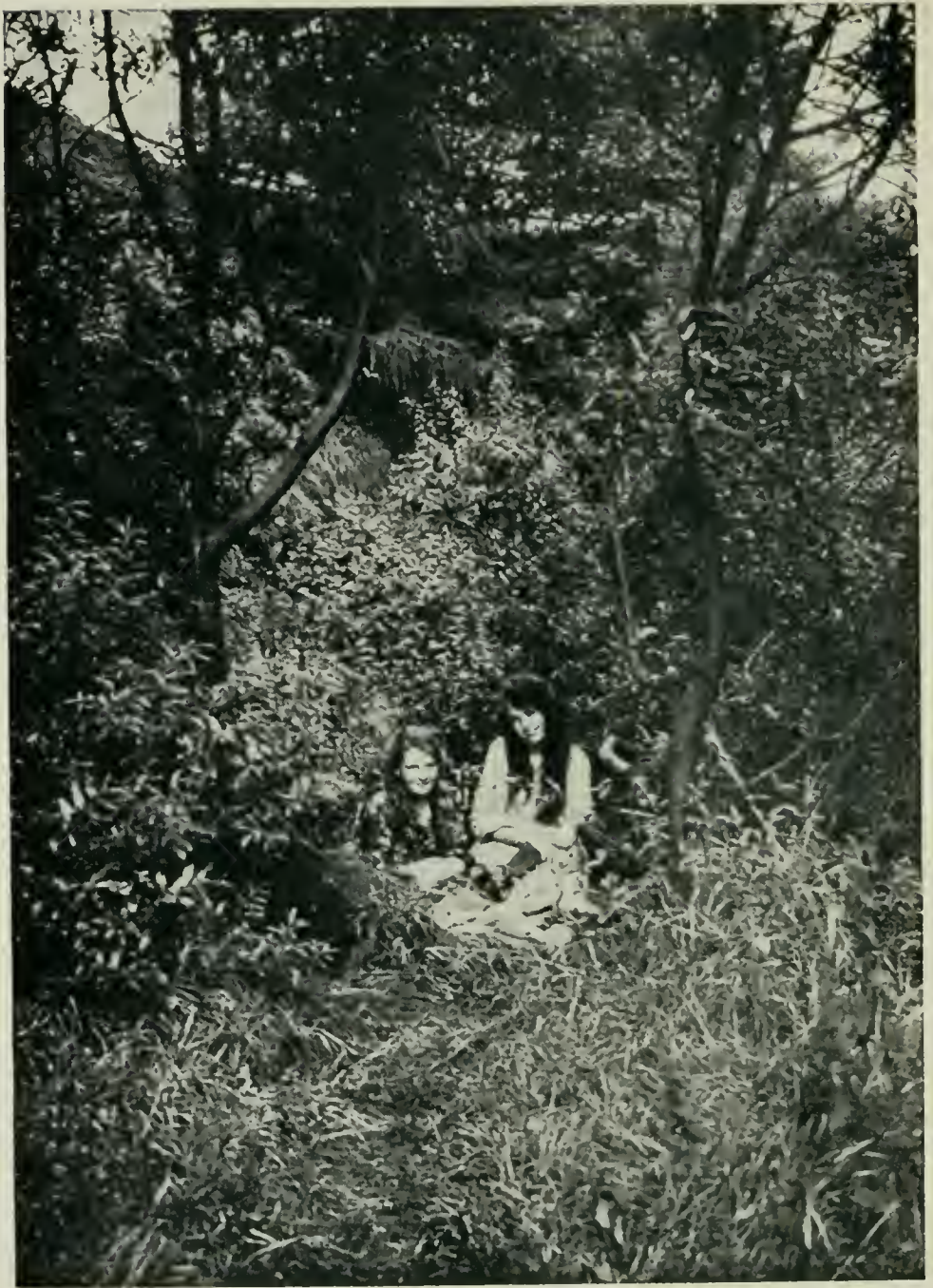
THE TWO GIRLS NEAR THE SPOT WHERE THE LEAPING FAIRY WAS TAKEN IN 1920