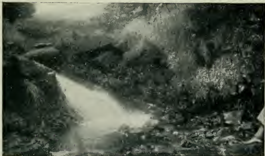
THE FALL OF WATER JUST ABOVE THE SITE OF LAST PHOTOGRAPH