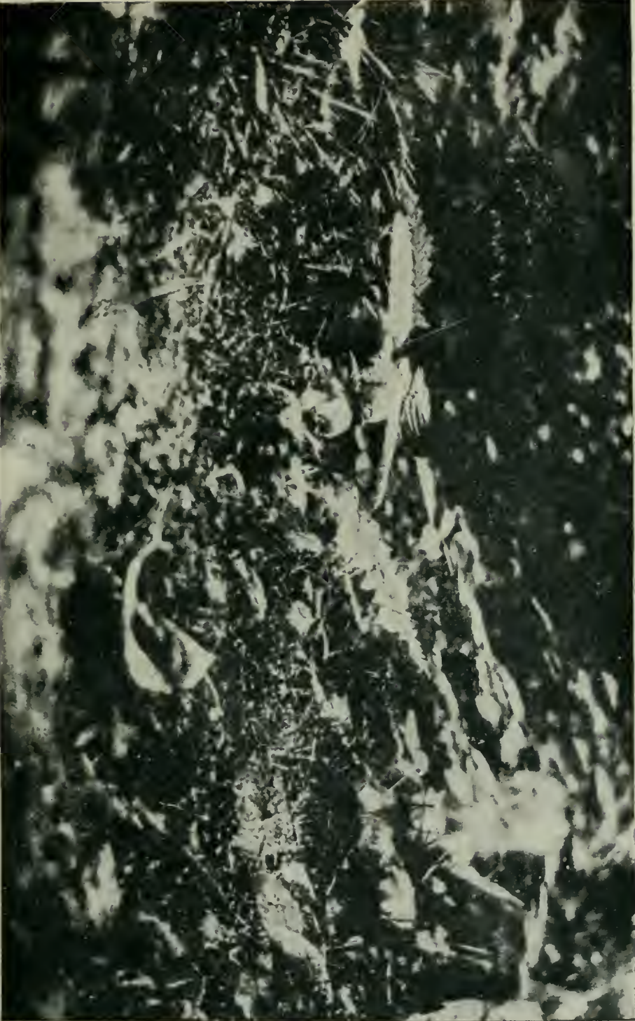
THE PHOTOGRAPH FROM CANADA