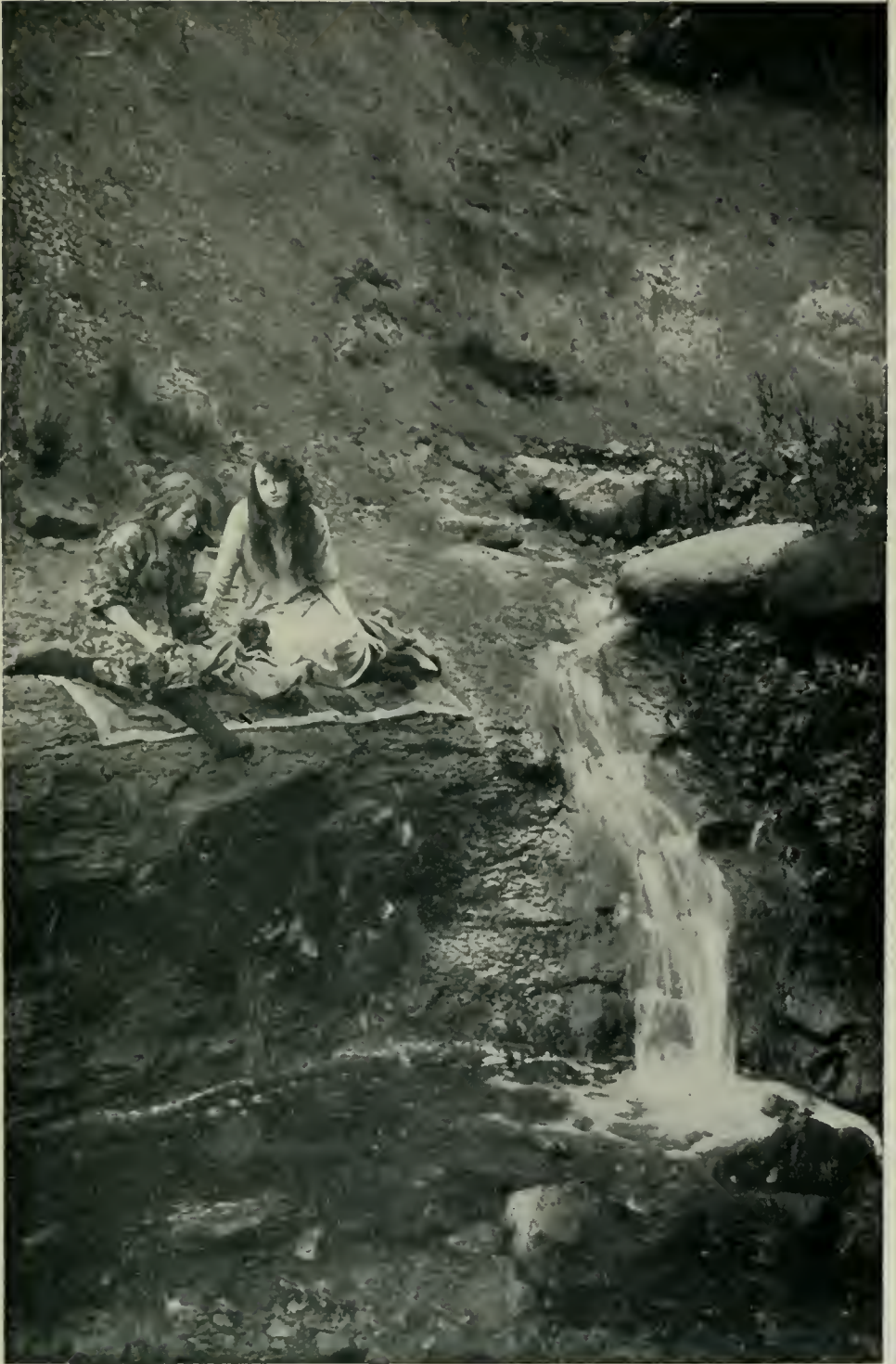
A VIEW OF THE BECK IN 1921